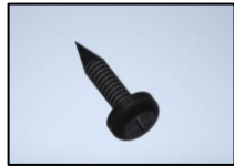
#8 x 5/8" PHP Screws

Failure to comply with installation instructions will compromise the safety, durability and performance of this product, which may risk injury to the user of this product and/or diminish the product life cycle. Jasper Group assumes no liability in these instances.