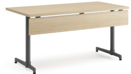
c. CANTILEVER BASE

Lok tilt/nest mechanisms ship factory installed to the table top for quick installation. Leg to mechanism attachment screws will be located in a hardware bag with HARDWARE ENCLOSED sticker and taped to the leg attachment plate on the tilt mechanism.