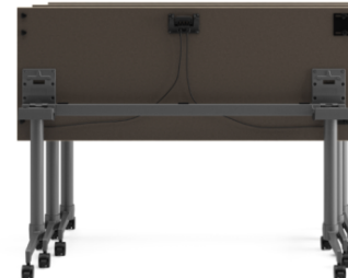
b. OFFSET NEST