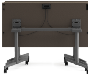
a. INLINE NEST

NOTE: all screws provided must be installed for proper installation and compliance with product warranty.