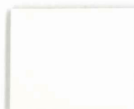
CPN111 Bright White