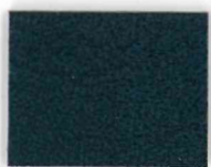
COA1572 Medium Blue