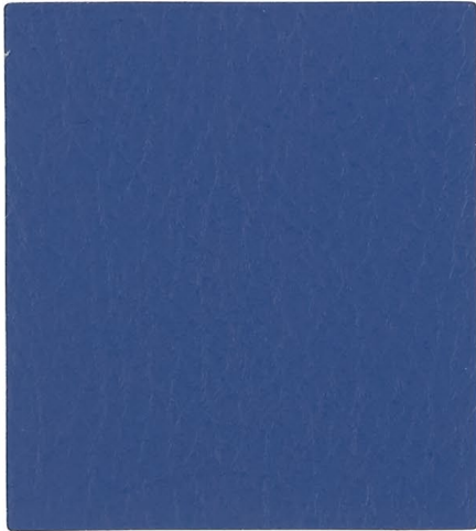
LRA 89 Champion