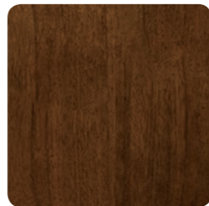
MONTANA WALNUT WIL-WL-10018-40-MP-SW WILSONART 7110-78