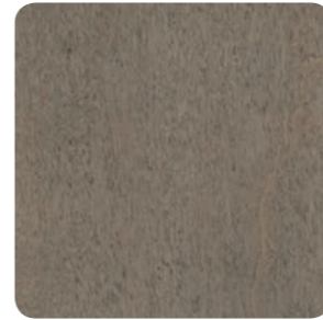
BLEACHED LEGNO FOR-MP-10015-20-MP-SW FORMICA 8845-58