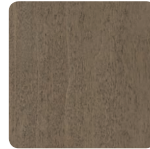
5TH AVE ELM WIL-MP-10004-20-MP-SW WILSONART 7966-12