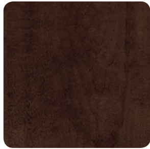
COLOMBIAN WALNUT WIL-MP-00123-40-MP-SW WILSONART 7943-07