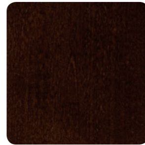
COCO BALA WIL-MP-10007-40-MP-SW WILSONART 7942-07