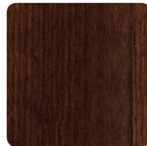
COLOMBIAN WALNUT WIL-WL-10020-40-MP-SW WILSONART 7943-07