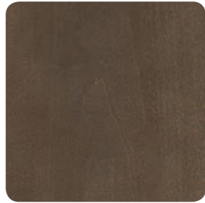
STUDIO TEAK WIL-MP-10001-20-MP-SW WILSONART 7960-18