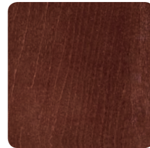
SELECT CHERRY FOR-MP-00013-40-MP-SW FORMICA 7759-43