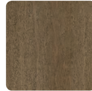
PINNACLE WALNUT WIL-MP-10009-20-MP-SW WILSONART 7992-38