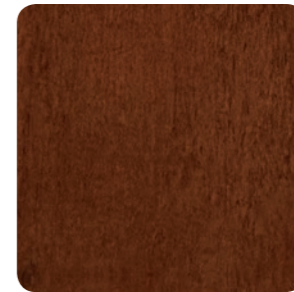
SHAKER CHERRY WIL-MP-10005-40-MP-SW WILSONART 7935-07