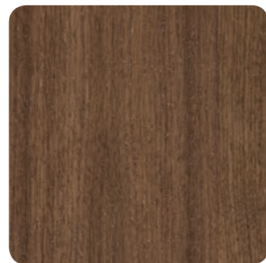
WALNUT HEIGHTS WIL-WL-10024-20-MP-SW WILSONART 7965-12