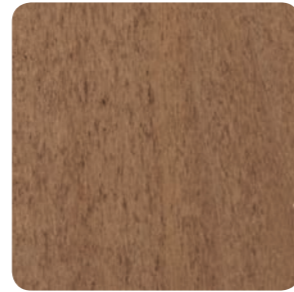
BRAZILWOOD WIL-MP-00145-20-MP-SW WILSONART 7946-38