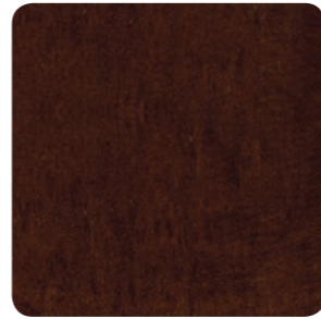
PRESTIGE WALNUT FOR-MP-10021-40-MP-SW FORMICA 6209-43