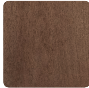
WALNUT HEIGHTS WIL-MP-10002-20-MP-SW WILSONART 7965-12