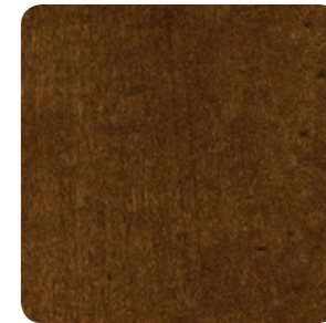
MONTANA WALNUT WIL-MP-00072-40-MP-SW WILSONART 7110-78