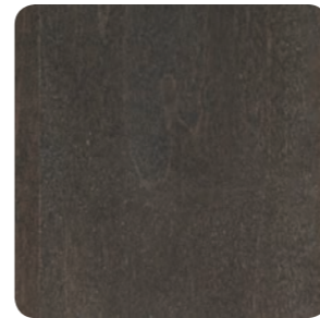
SKYLINE WALNUT WIL-MP-10008-20-MP-SW WILSONART 7964-12