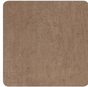
PECAN WOODLINE FOR-MP-10011-20-MP-SW FORMICA 5883-58