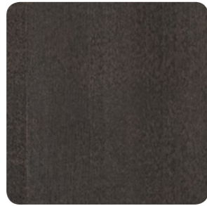
ASIAN NIGHT WIL-MP-10003-20-MP-SW WILSONART 7949-18