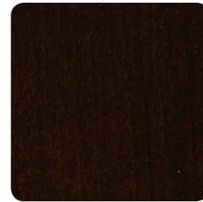
CAFELLE WIL-MP-00071-40-MP-SW WILSONART 7933-07