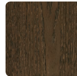
WAREHOUSE OAK WIL-OK-10023-20-OK-SW WILSONART 7969-12

Due to limitations of the printing process, colors may differ from wood samples. Contact Customer Service for samples at 800.798.5536.