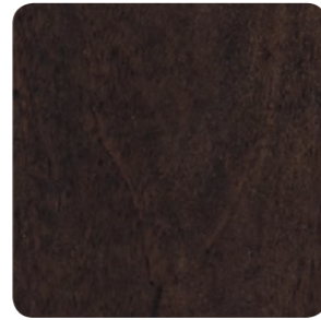
BLACKENED LEGNO FOR-MP-10013-20-MP-SW FORMICA 8845-58