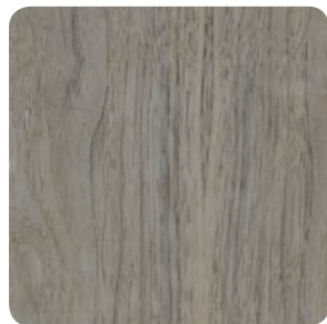
WEATHERED ASH FOR-WL-10017-20-MP-SW FORMICA 8842-WR