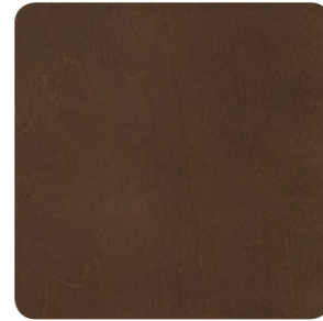
WAREHOUSE OAK WIL-MP-10006-20-MP-SW WILSONART 7969-12