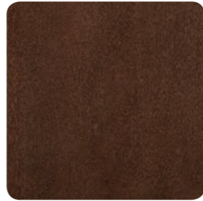
SORREL CHERRY FOR-MP-00232-20-MP-SW FORMICA 5886-58