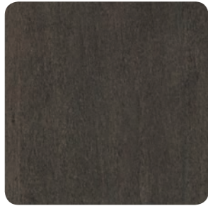
SMOKY BROWN PEAR FOR-MP-10012-20-MP-SW FORMICA 5488-58