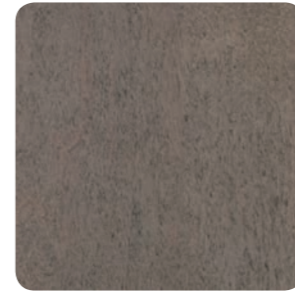
WEATHERED ASH FOR-MP-10014-20-MP-SW FORMICA 8842-WR