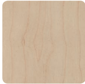
NATURAL ASH FOR-MP-10016-20-MP-SW FORMICA 8843-WR