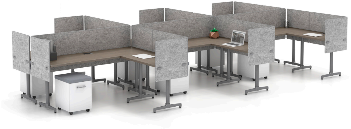
LKT012 rectangular table stations with power, privacy and storage