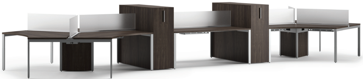
FLT104 fixed six pack with 120 and linear