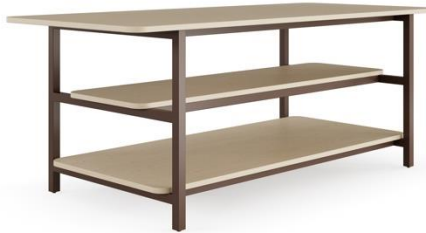
bar height with shelves