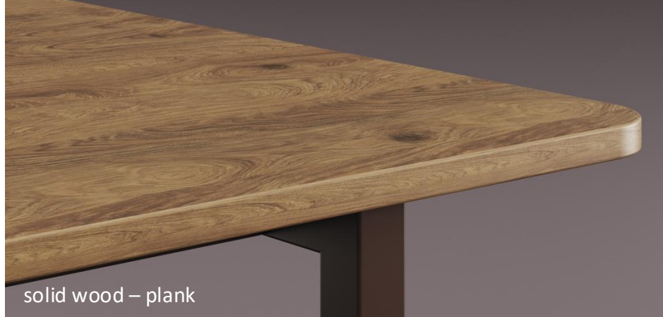
solid wood – plank