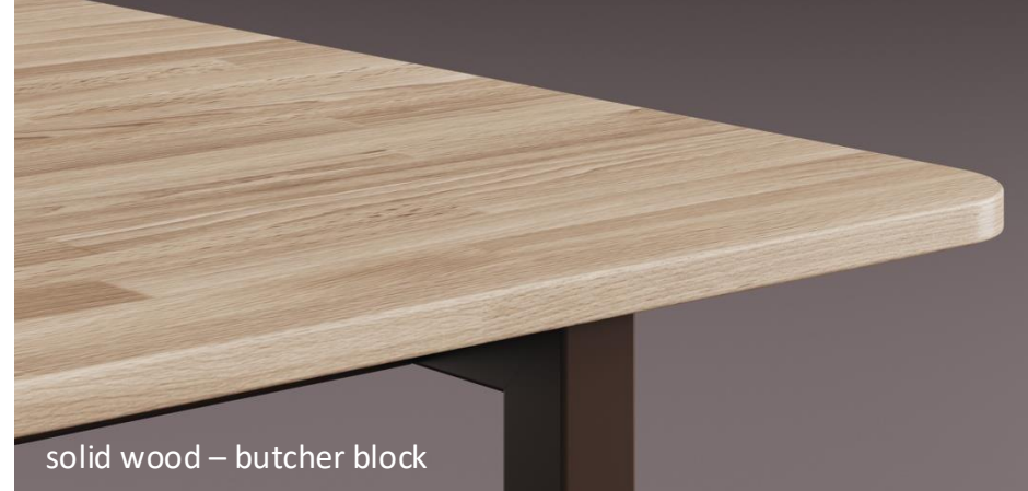
solid wood – butcher block