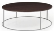
ZIVA OCCASIONAL TABLE