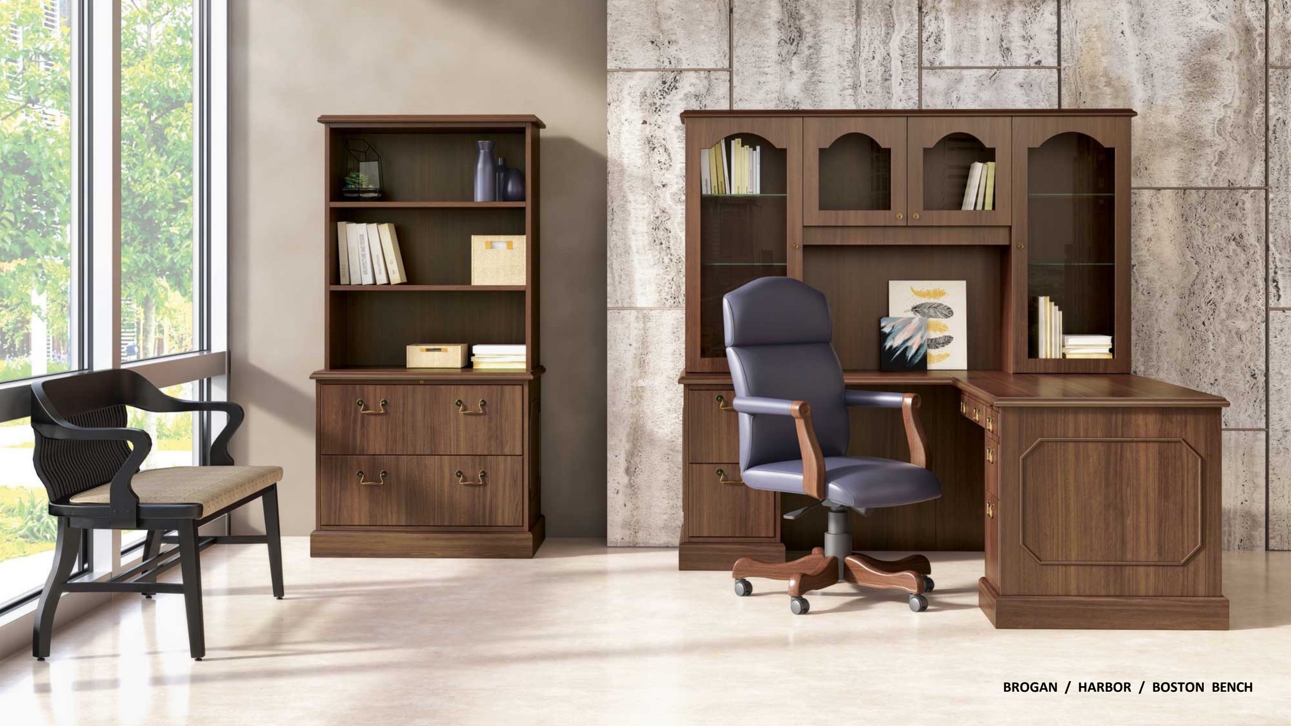
BROGAN / HARBOR / BOSTON BENCH