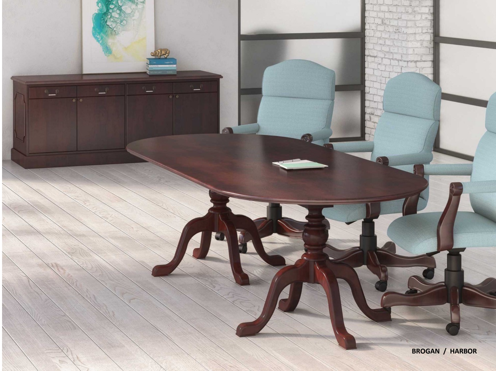
BROGAN / HARBOR