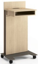
NATIVE LECTERN WITH STORAGE