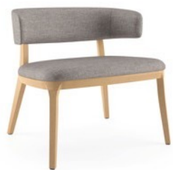
JUDE LOUNGE CHAIR