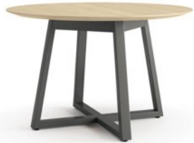
NATIVE ROUND TABLE