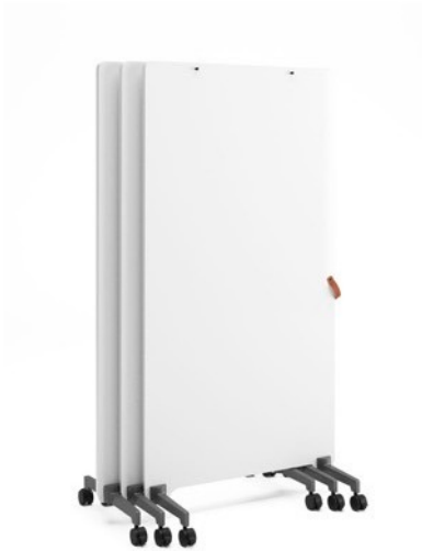
LOK NESTING MOBILE BOARDS