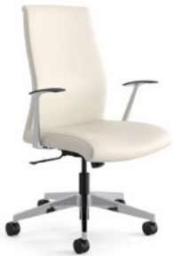
PROXY HIGH BACK SWIVEL