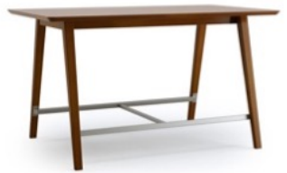
BOURNE BAR HEIGHT TABLE