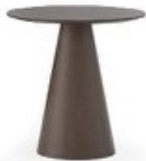
CONICAL PULL-UP TABLE