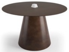
CONICAL TABLE WITH POWER