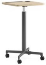
LOK ADJUSTABLE-HEIGHT PODIUM