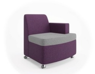
MOBILE CONVEX LOUNGE CHAIR