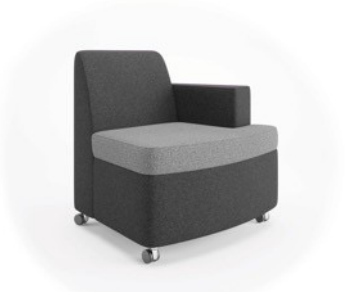
MOBILE CONVEX LOUNGE