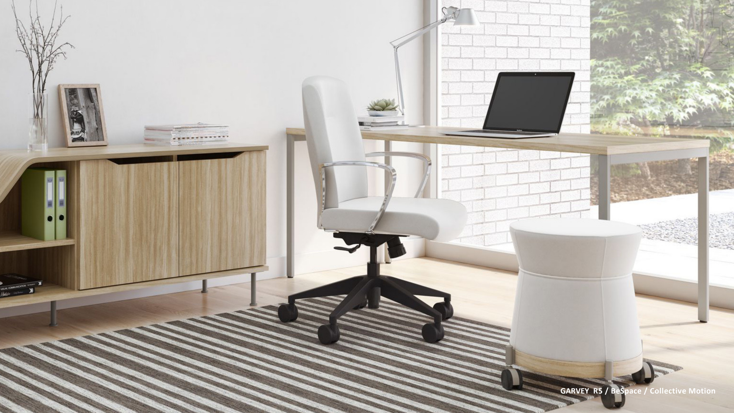
GARVEY R5 / BeSpace / Collective Motion