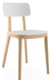
JUDE ARMLESS CHAIR