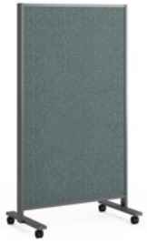
NATIVE MOBILE TACKBOARD