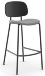
BRYN COUNTER HEIGHT STOOL