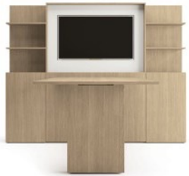
NATIVE MEDIA WALL