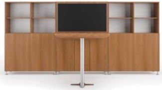
MEDIA TABLE AND BOOKCASES