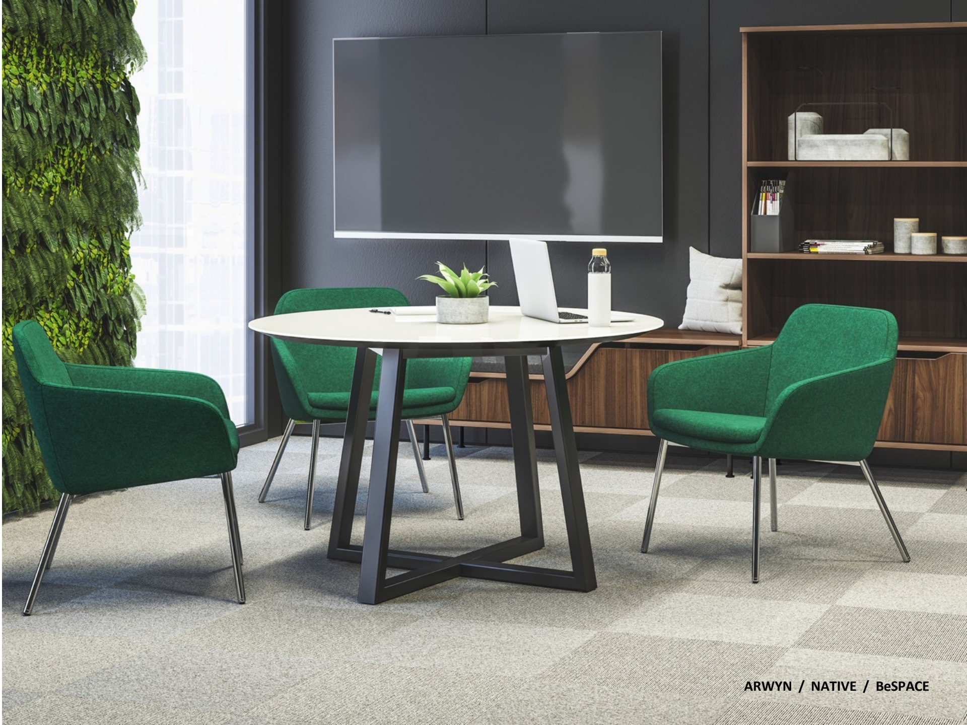
ARWYN / NATIVE / BeSPACE