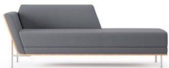
CHAISE BENCH WITH PARTIAL BACK