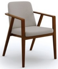
BOURNE GUEST SEATING