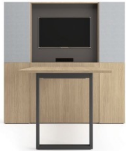
NATIVE RUNOFF TABLE AND MEDIA WALL