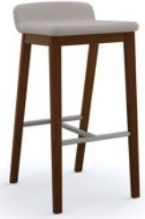
BOURNE BAR STOOLS