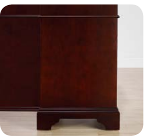
wellington molding with standard base