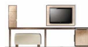
typical configuration 07