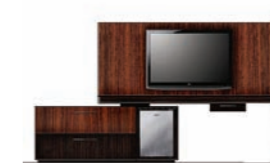
typical configuration 08