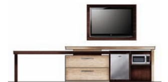
typical configuration 09