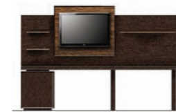
typical configuration 01