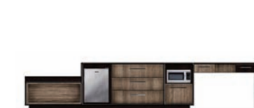
typical configuration 11