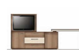
typical configuration 02