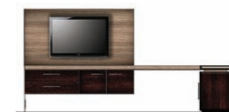
typical configuration 05