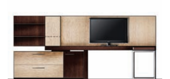
typical configuration 06