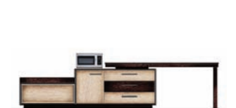
typical configuration 12