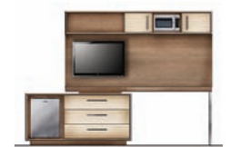
typical configuration 03