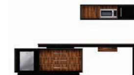
typical configuration 10