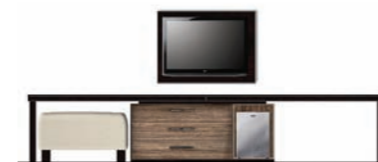
typical configuration 04